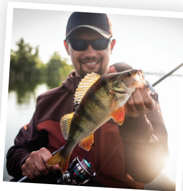
Fishing with Friends & Family 2024

We offer an assortment of mortgage loan options that will make your home buying process simple, and easy.